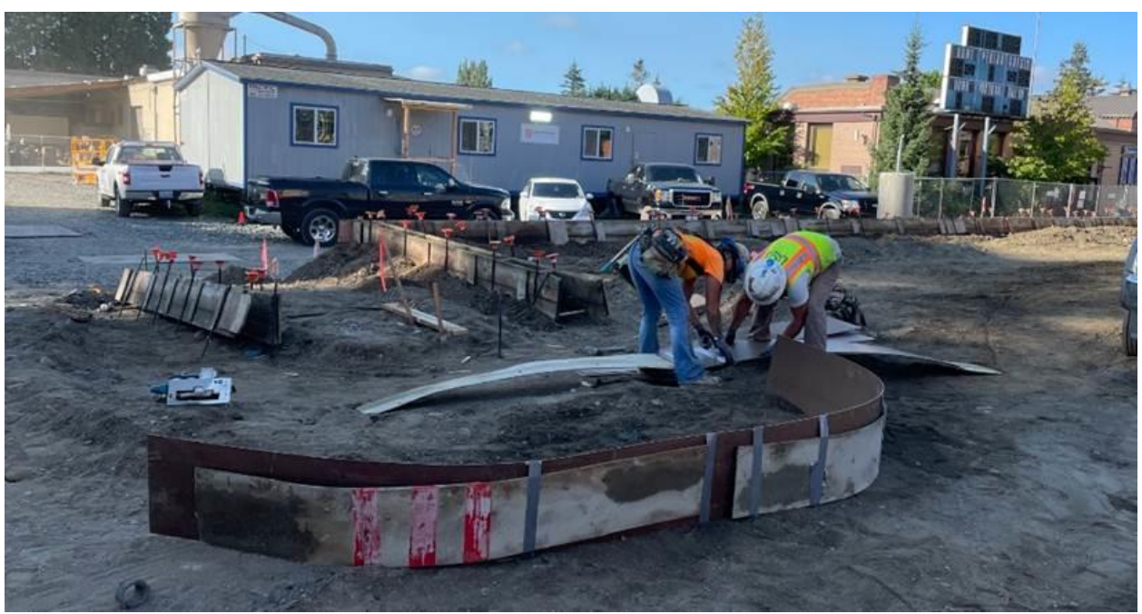
Curbs and gutters being formed at the staff parking area south of the Academic Wing