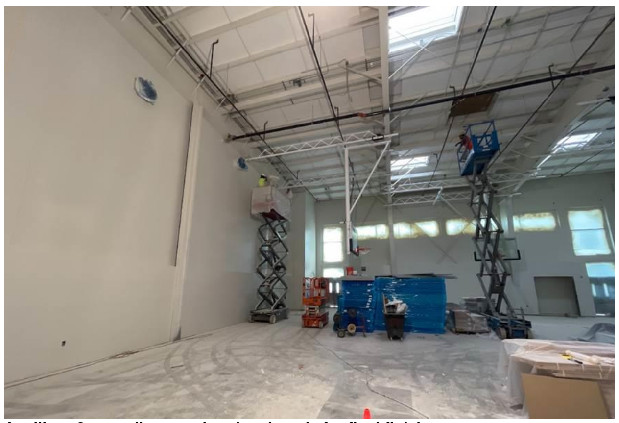
Auxiliary Gym walls are painted and ready for final finishes