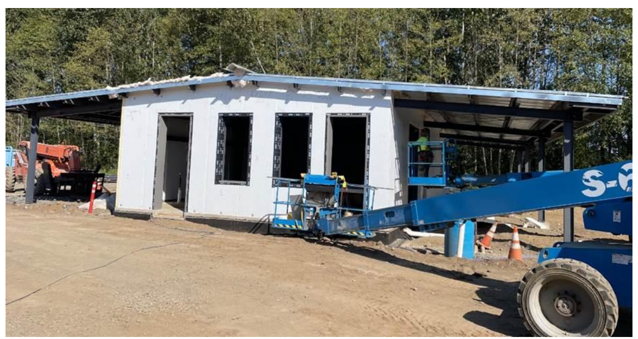
Wall panel installation at the Agriculture Science building