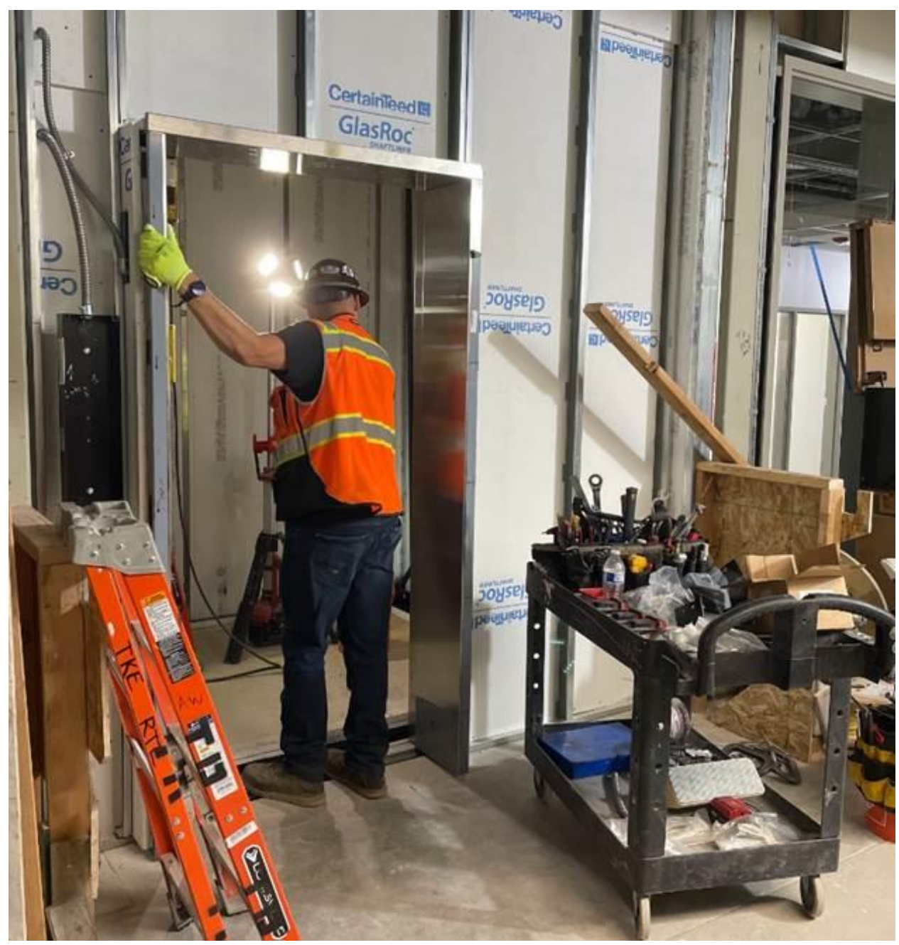
Entryway door and front wall of the elevator being installed