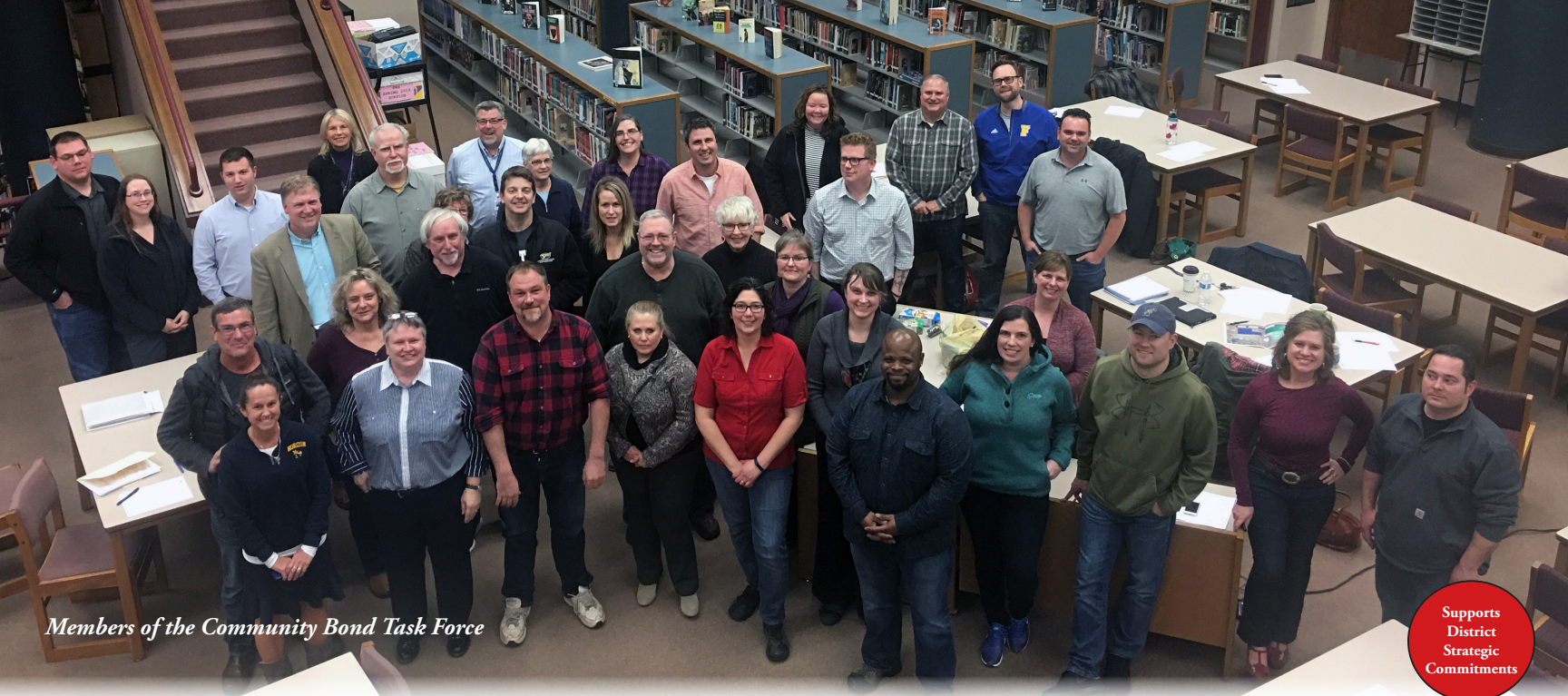
Members of the Community Bond Task Force