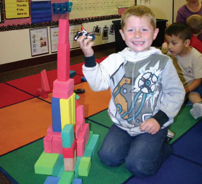
Pictured: Student participating in last year's summer program