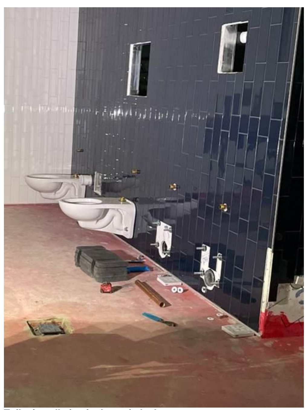
Toilet installation in the main locker rooms