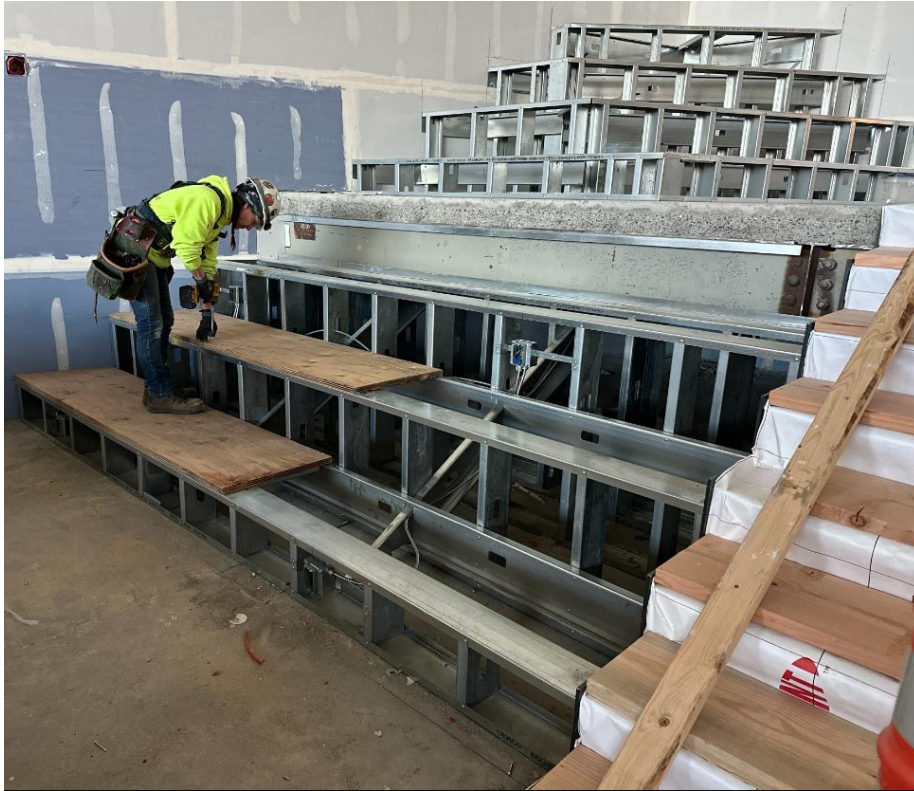
Common Area gathering benches and stairs being installed