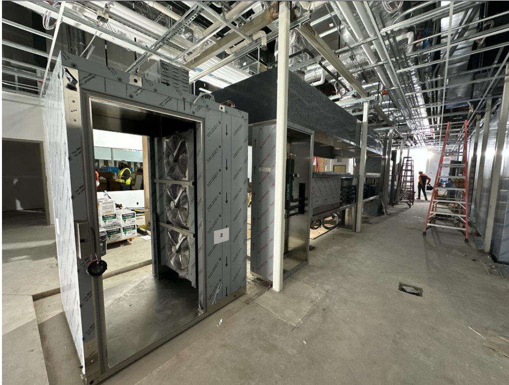
Cooking line, exhaust hoods and ceiling grid installation in the kitchen