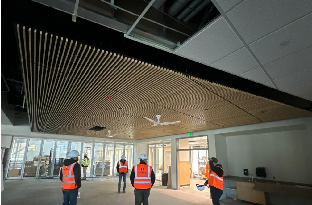
Wood ceiling installation in the library