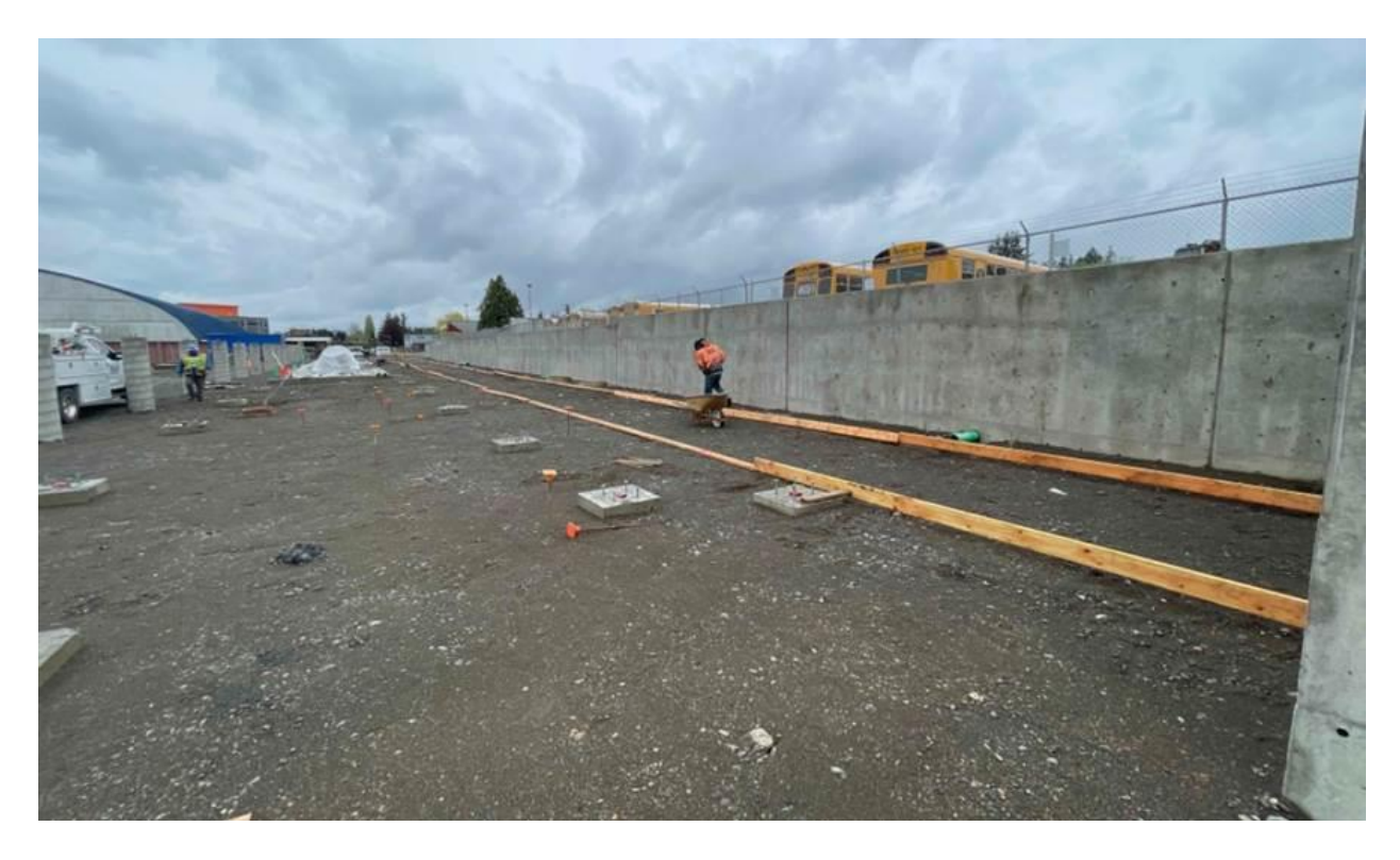
Crews installing formwork for the hardscapes around the Grandstands