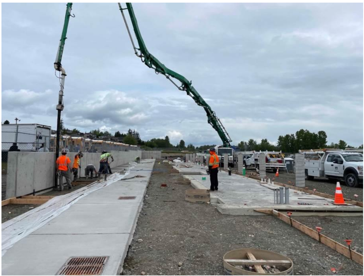
Pouring hardscapes around the Grandstand area