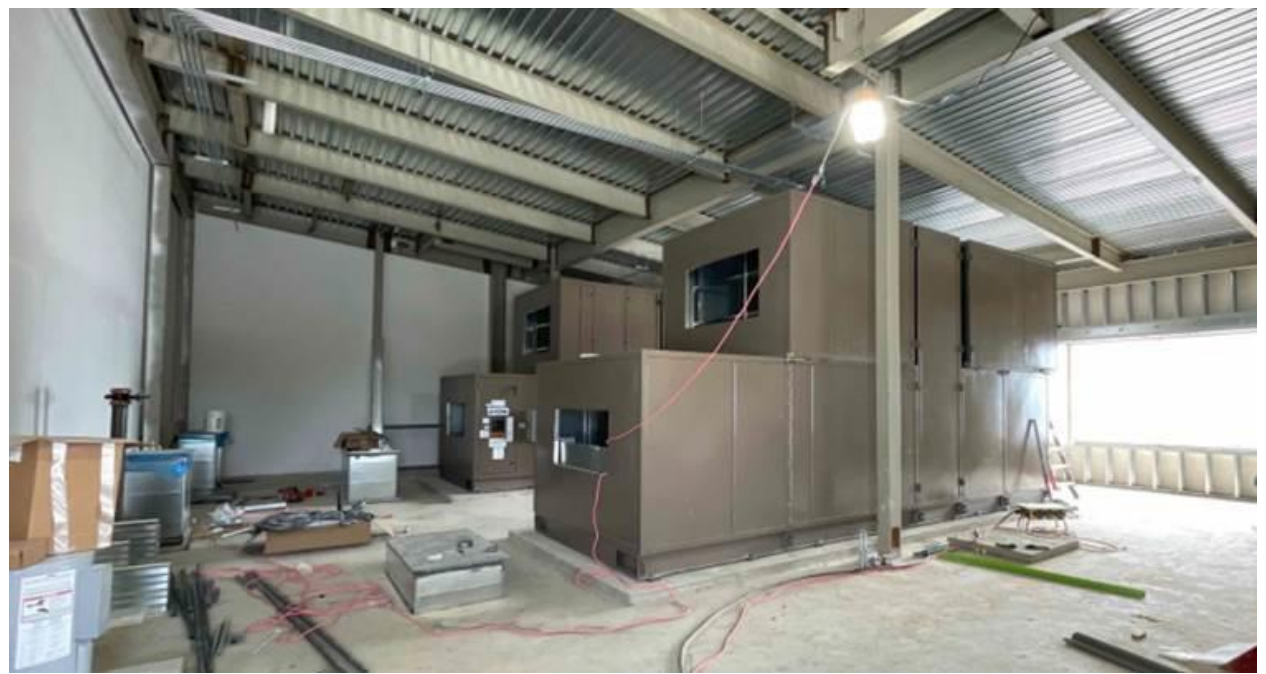
Installing air handling equipment in the Academic Wing