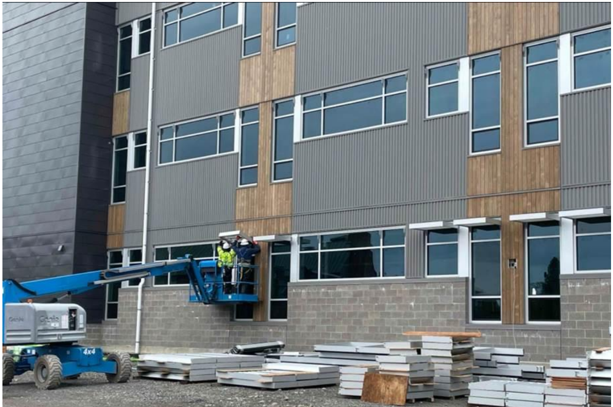
Installing sunshade on the south side of the Academic Wing