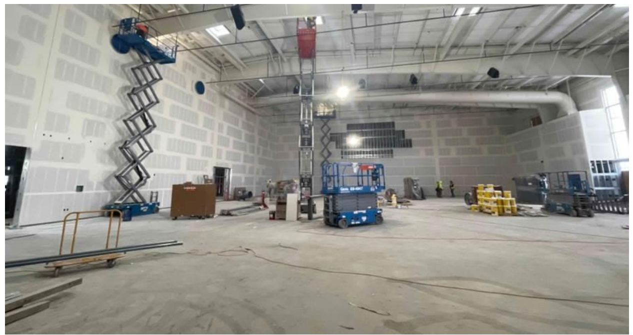
Mudding and taping the sheetrock joints in the Main Gym