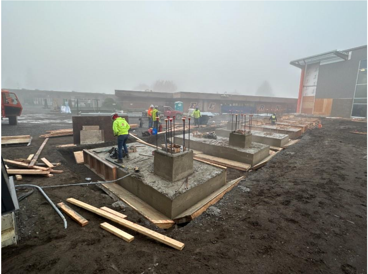
Crews stripping forms off of the column footings that support the canopy over the covered walkway in the courtyard