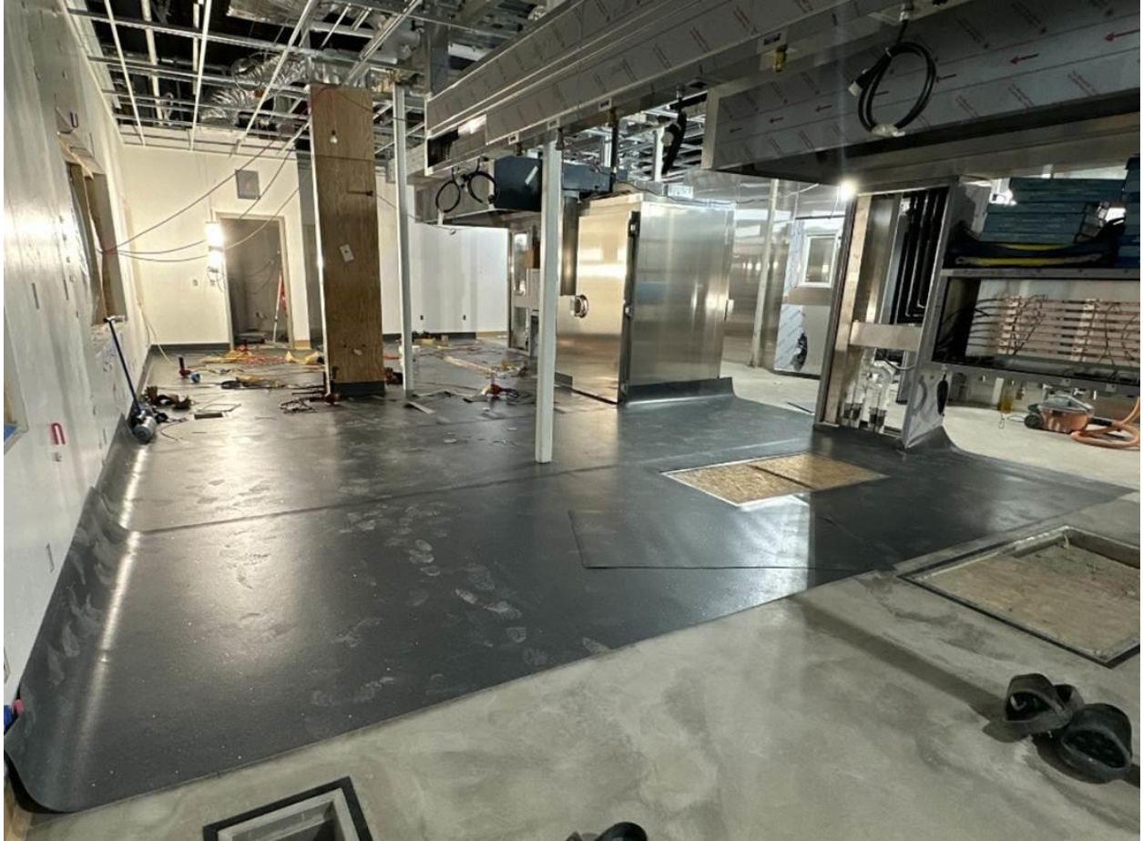
Flooring installation in the kitchen area