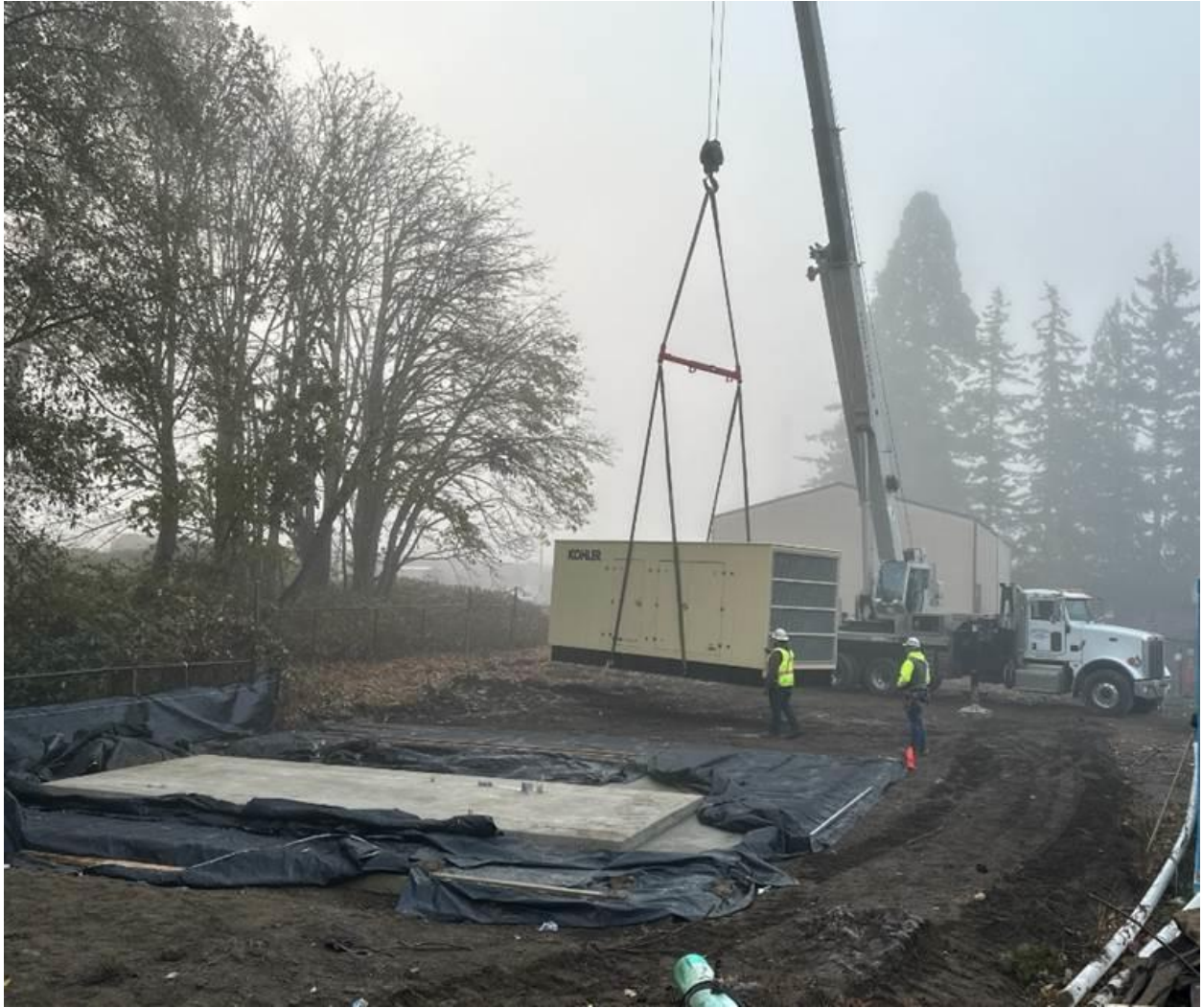
Emergency generator being lifted into place on a foggy morning