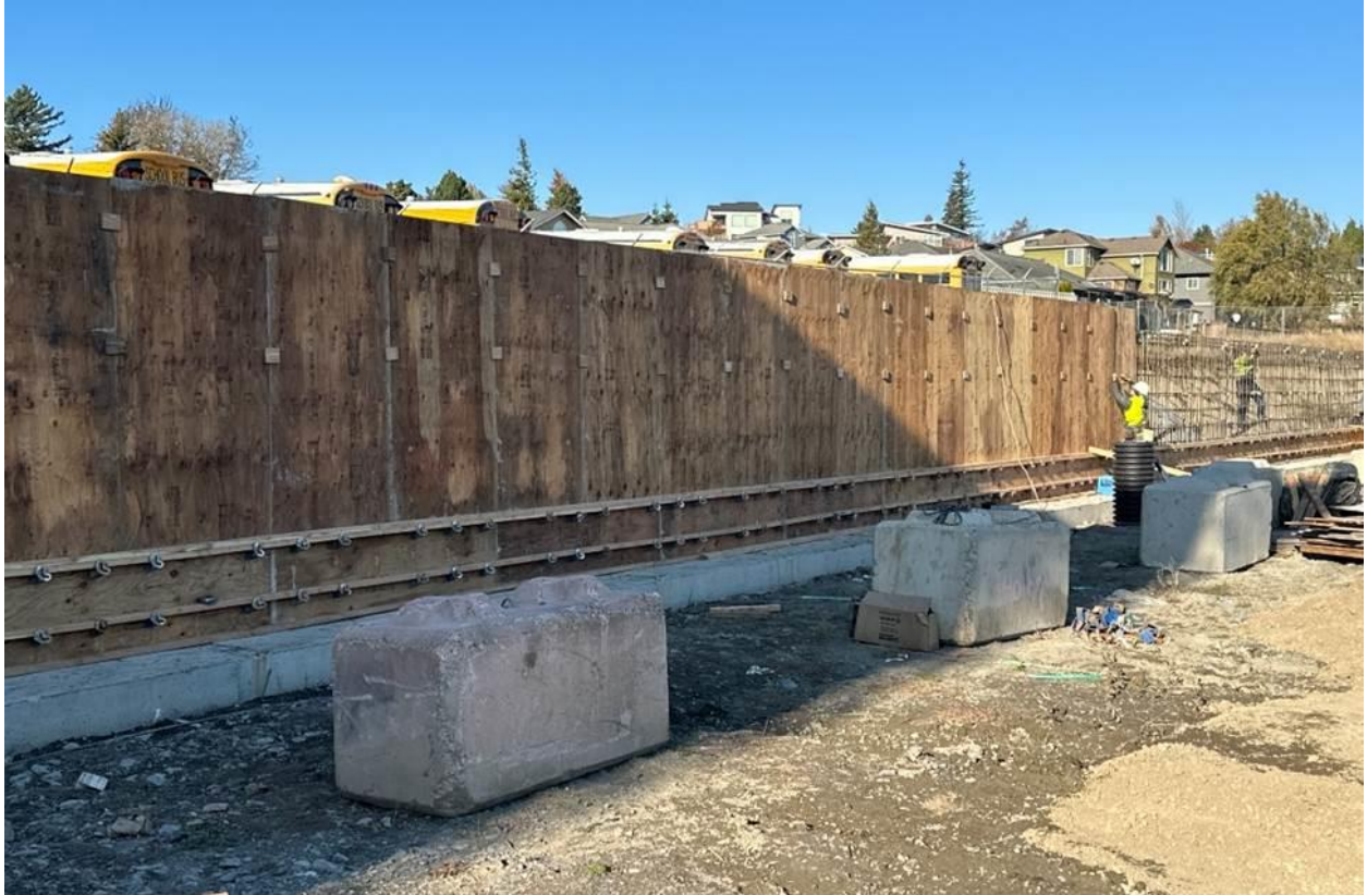
Retaining wall forming around the high jump area at the north end of the Grandstand