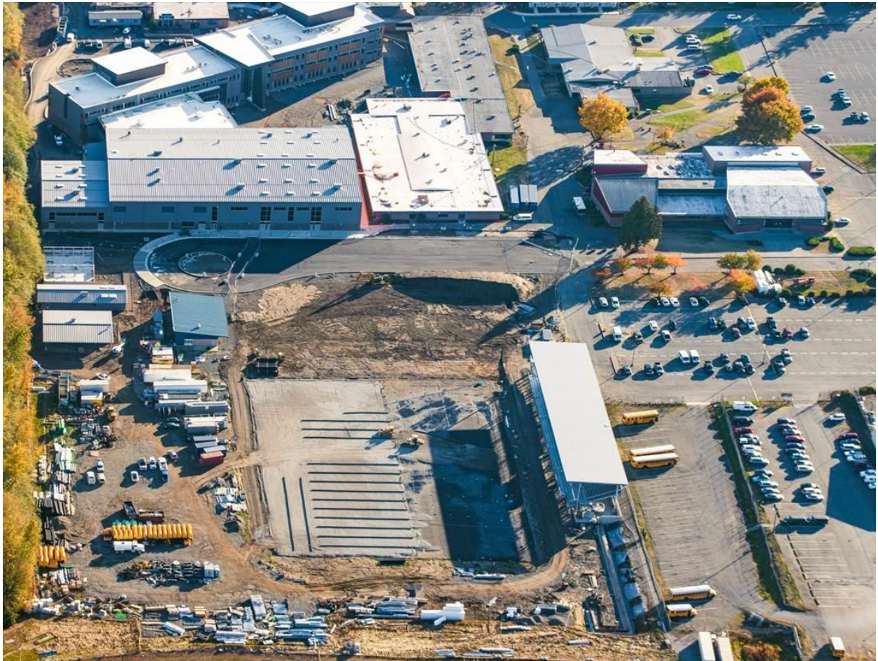
The November aerial project photo