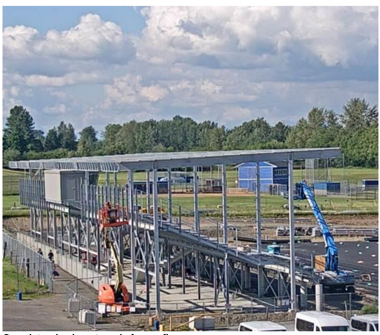
Grandstands almost ready for roofing