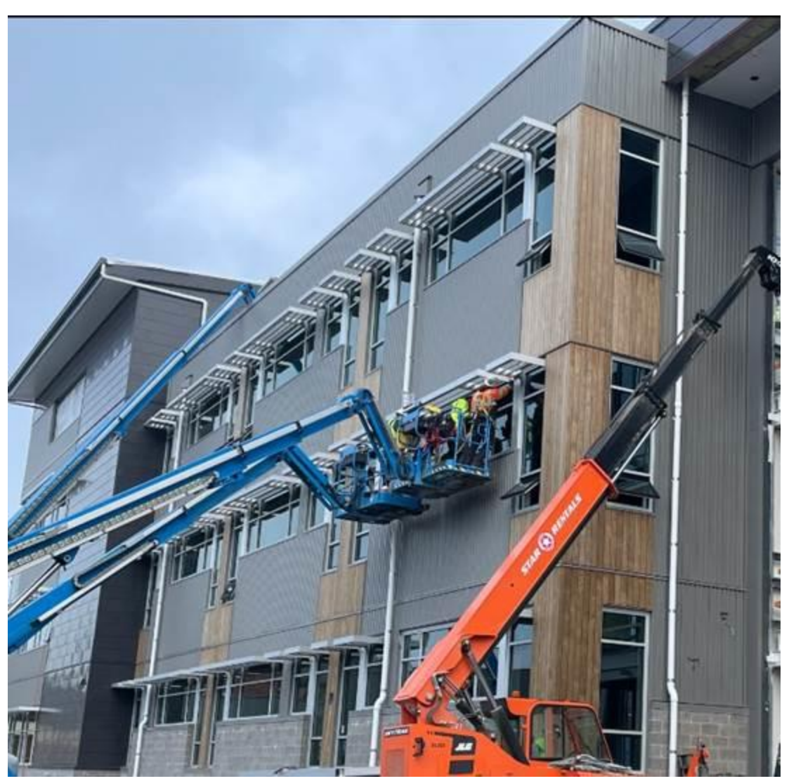
Sunshade installation on the Academic Wing is almost complete