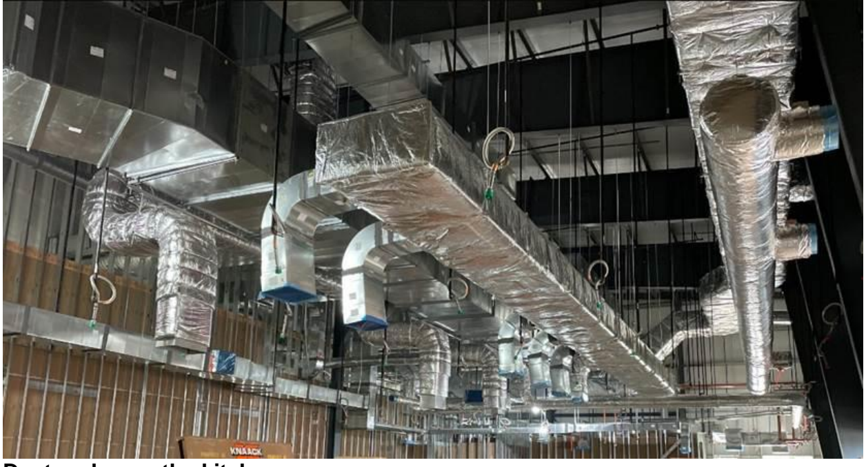
Ductwork over the kitchen area